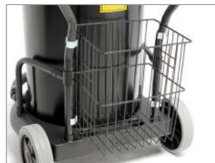
OPTIONAL TOOL HOLDER