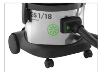
TROLLEY WITH 2 FRONT SWIVELLING WHEELS AND 2 LARGE REAR WHEELS