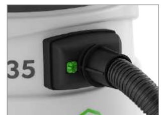
FLEXIBLE HOSE IS LOCKED SECURELY AND RELIABLY