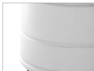
ULTRA-SHOCKPROOF PLASTIC TANK