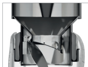
SELF DISCHARGE VALVE