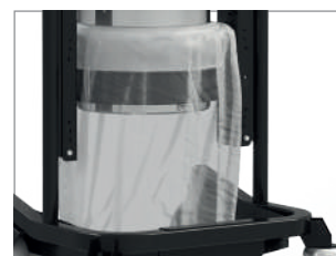
MAXIBAG COLLECTION SYSTEM