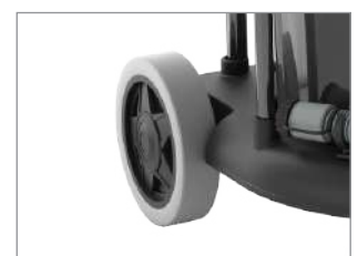
LARGE REAR WHEELS WITH TYRES